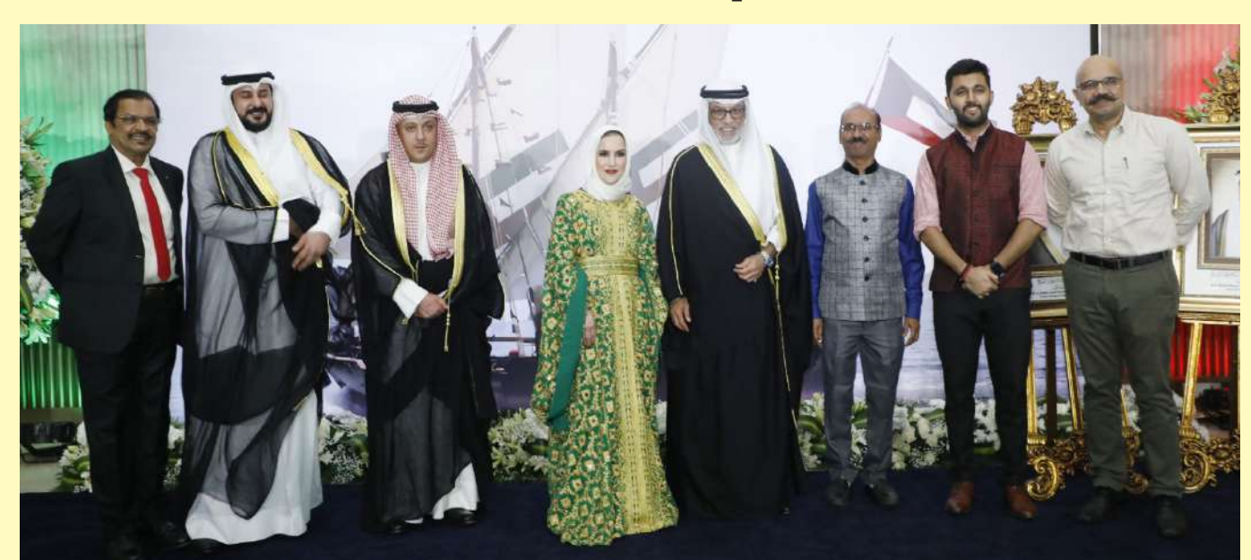
Dignitaries at the function.